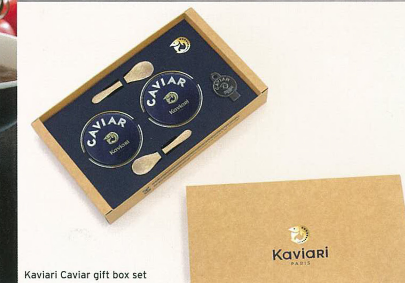
Kaviari Caviar gift box set