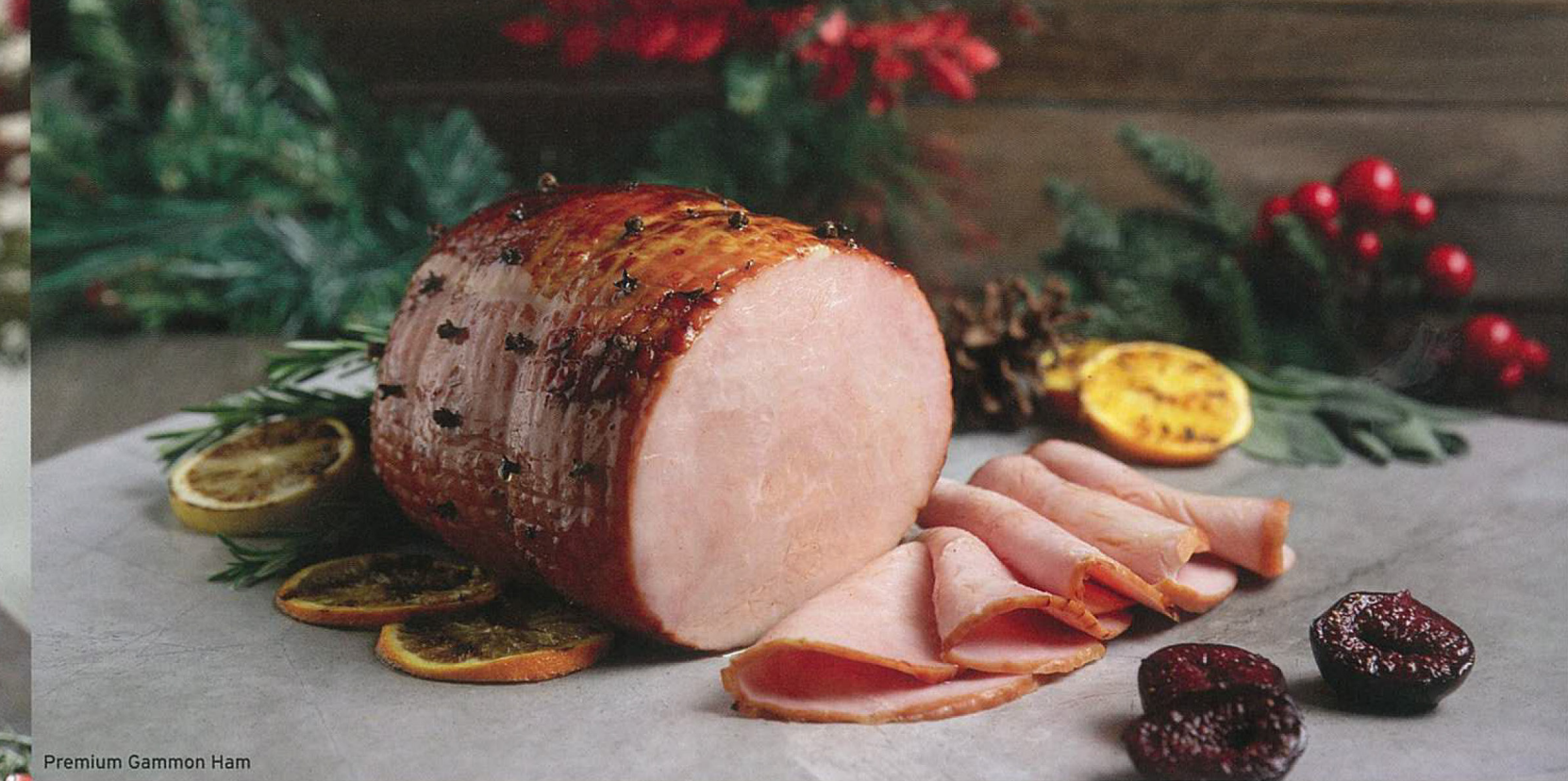
Premium Gammon Ham

The feasting continues with a luxurious box of 24 fresh French oysters, including the premium Fine de Claire Marennes, farmed in a seawater and freshwater pond; Royal Oyster, best served with chilled Champagne; and Oyster Belon, prized for their nutty flavour and firm flesh. Not forgetting caviar, which adds another decadent touch to the table – Kaviari's Kristal®, Oscière Prestige and Baeri Royal are available in 30g and 50g options ($65 to $135). Go for the full works when you purchase the Kaviari gift box set which